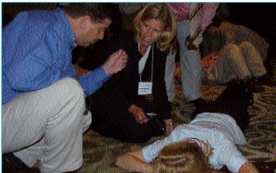
Participants attend an interactive lecture during the first WFATT World Congress, held in June 2001.

World Congress],” Ogar said. “They’re very specific with soccer, and I’ve been able to ask a lot of questions and learn a lot of new things. I think sometimes you can come into a national convention and have so many topics that it can scatter your attention a little.”